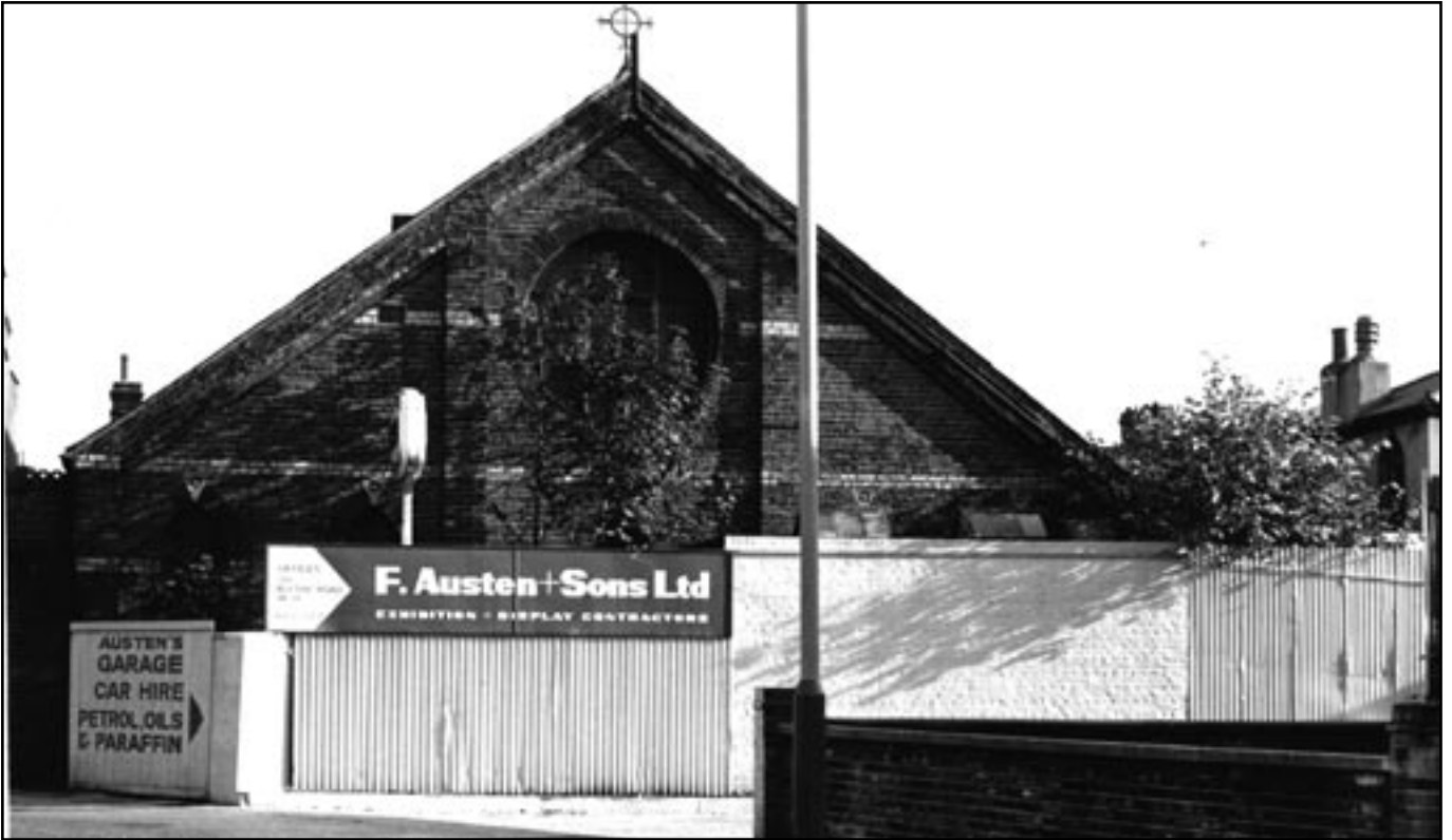
This photograph of 188a Blythe Road was taken in 1972.