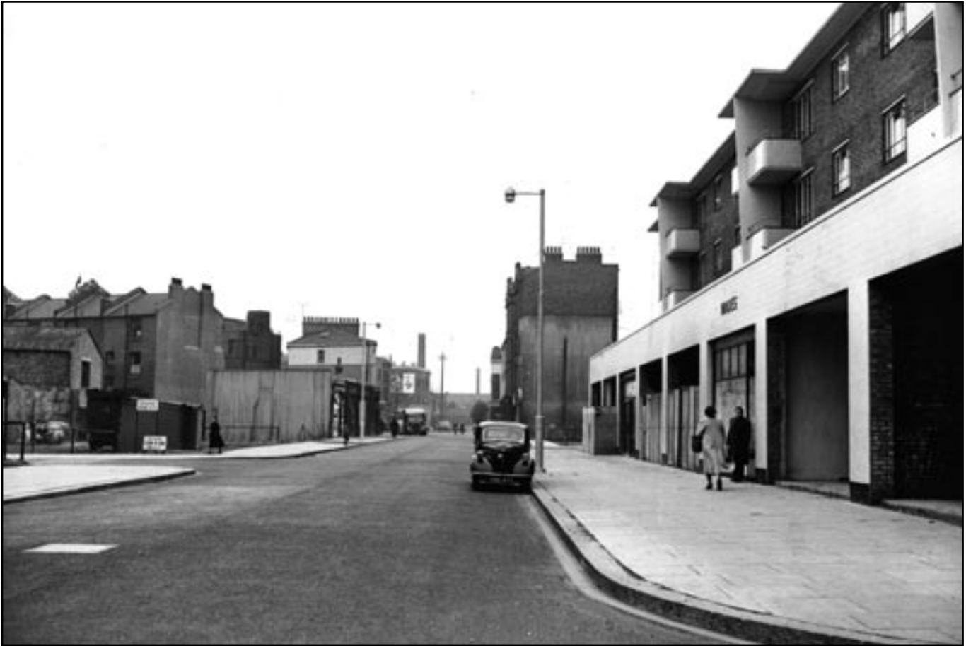
This view of Blythe Road was taken in 1954.