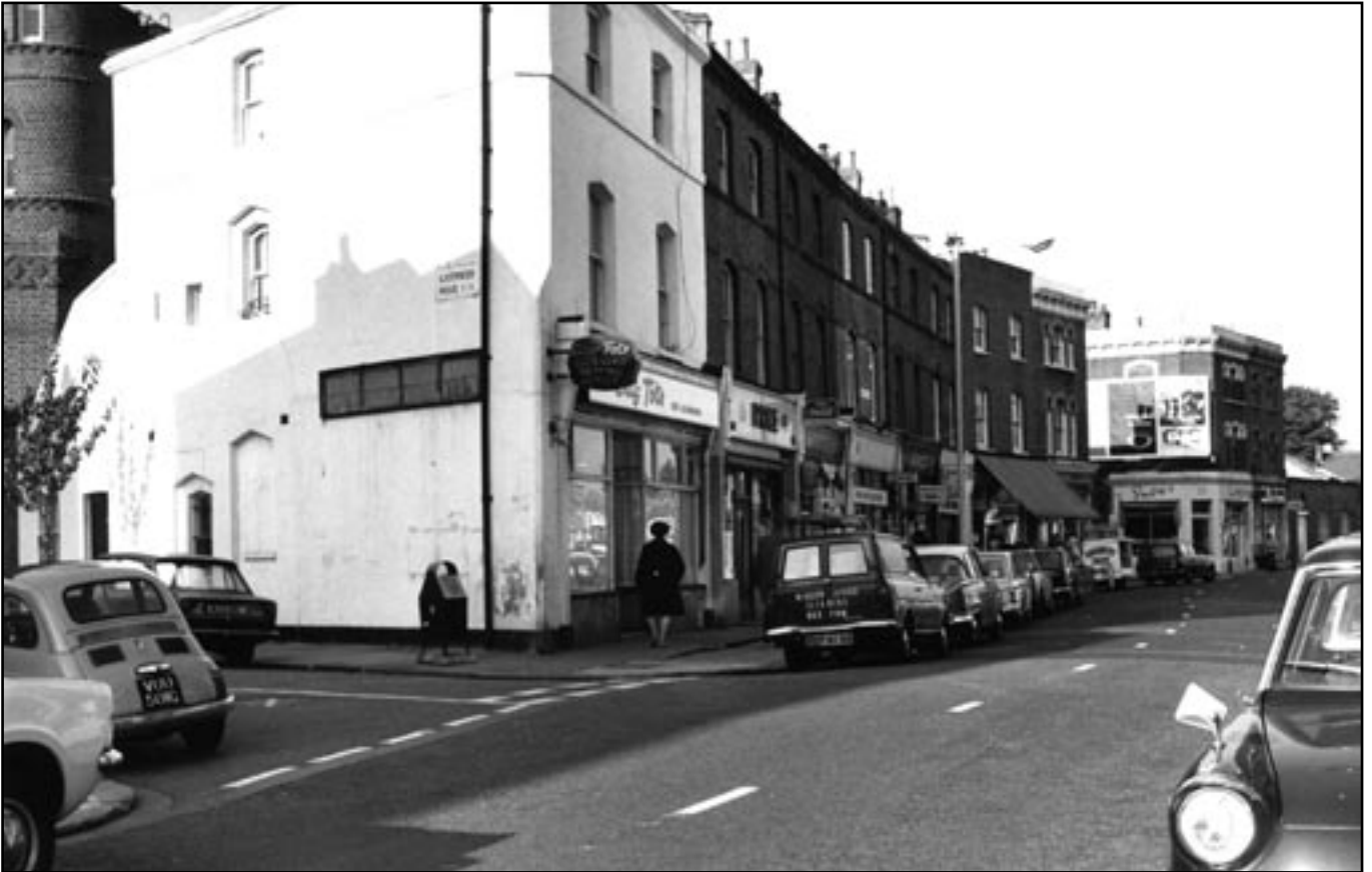
This is a photograph of the shops, numbers 59 to 79 Blythe Road, taken in 1972.